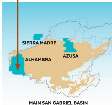
MAIN SAN GABRIEL BASIN